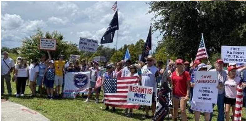
TCCR Staff Photos